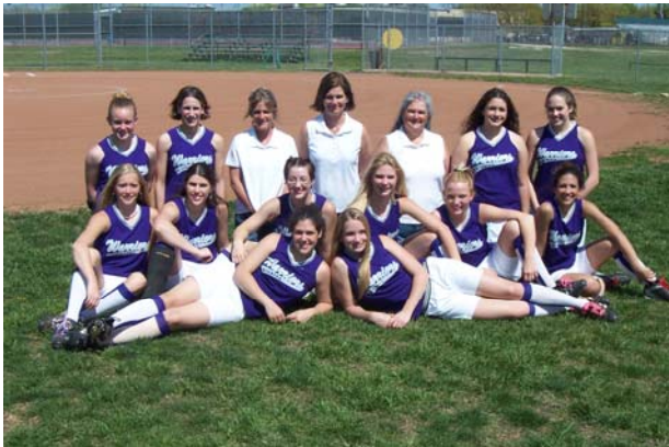
Wichita, KS Lady Warriors